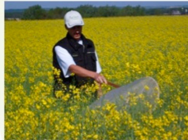
Sweeping Winter Rape, Hungary