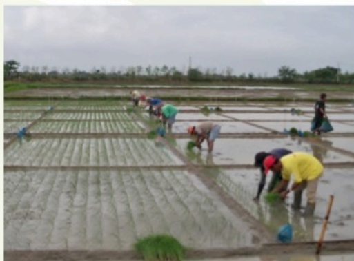
Manual Rice Transplanting, Philippines